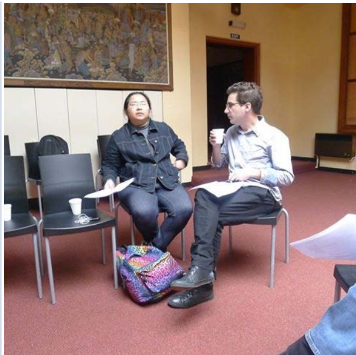
Like · Comment · Share