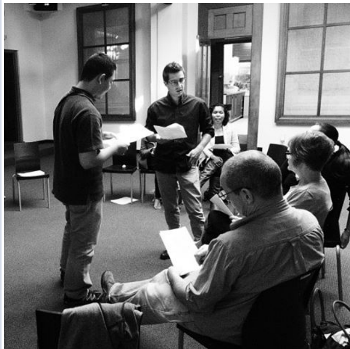
Like · Comment · Share