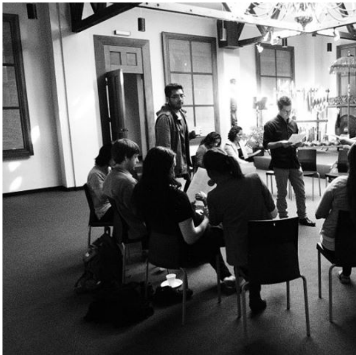
Like · Comment · Share