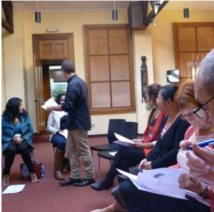
Like · Comment · Share